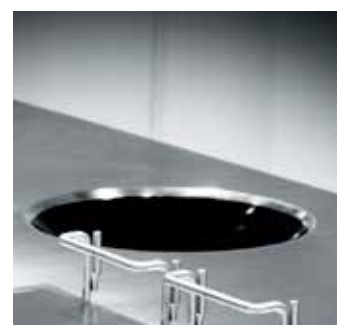
High Power Induction Wok