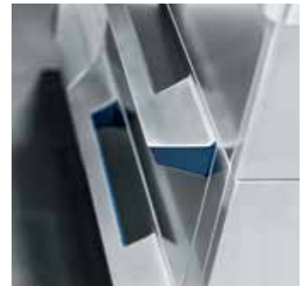
Refrigerated / Freezer Base