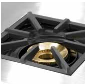
HP Single Burner