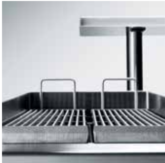
High Power Chargrill