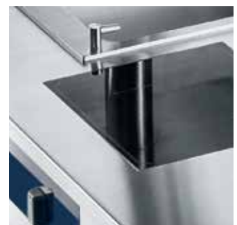
Full Surface Induction