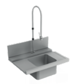
18 Pre-wash table options

Create your own made-to-measure handling system combinations from a large number of available options: