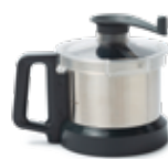
2,6 Lt bowl in AISI 304 stainless steel