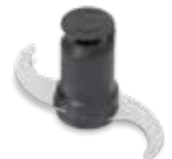
Smooth blade rotor