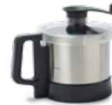
3,6 Lt bowl in AISI 304 stainless steel