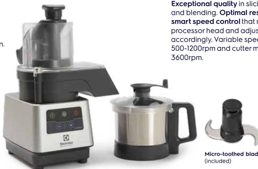
Micro-toothed blade rotor (included)

Over 75 years experience in designing high performing solutions for food preparation.