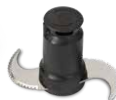
Micro-toothed blade rotor (included)