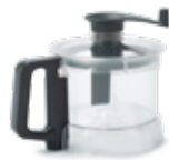
2,6 Lt bowl in transparent copolyester

Prepare multiple menu variations with a series of optional accessories.