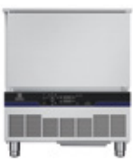
15/5 kg - 5 GN 1/1 External dimensions (wxdxh) 762x760x902 mm Electrical power - 1.1 kW

Our Blast Chiller Freezers range offers high strength and longevity. With its high durability, you can trust that your investment is sure to last for years to come, making it an excellent choice for those looking for a reliable, value for money and long-lasting solution.