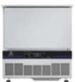
15/5 kg - 5 GN 1/1 External dimensions (wxdxh) 762x708x850 mm Electrical power - 1.1 kW

Installation flexibility, with new undercounter version you can fit in a wide range of kitchen environment