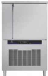
80/40 kg - 10 GN 2/1 External dimensions (wxdxh) 1000x955x1645 mm Electrical power - 5.2 kW