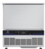
25/15 kg - 5 GN 1/1 External dimensions (wxdxh) 762x708x850 mm Electrical power - 1.5 kW