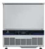
25/15 kg - 5 GN 1/1 External dimensions (wxdxh) 762x708x850 mm Electrical power - 1.58 kW