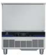
15/5 kg - 5 GN 1/1 External dimensions (wxdxh) 762x760x902 mm Electrical power - 0.73 kW

Our Blast Chiller Freezers range offers more than just maximum strength and longevity. With more than 30 years durability, you can trust that your investment is sure to last for years to come, making it an excellent choice for those looking for a reliable, value for money and long-lasting solution.