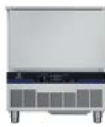
25/15 kg - 5 GN 1/1 External dimensions (wxdxh) 762x760x902 mm Electrical power - 1.58 kW