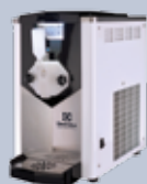
Ice Cream Machine Small, silent and powerful Soft Ice Cream Dispensers will make your business boom