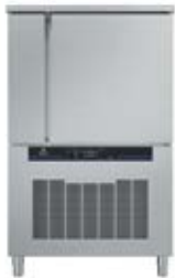
80/40 kg - 10 GN 2/1 External dimensions (wxdxh) 1000x955x1645 mm Electrical power - 3.96 kW