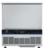
15/5 kg - 5 GN 1/1 External dimensions (wxdxh) 762x708x850 mm Electrical power - 0.73 kW

Installation flexibility, with new undercounter version you can fit in any kitchen environment.