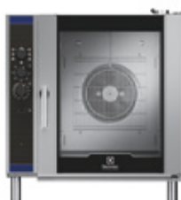
10 GN1/1 External dimensions (wxdxh) 890 x 910 x 950 mm Electrical power - 17.3 kW Gas power - 18.5 kW + 0.35 (electric)