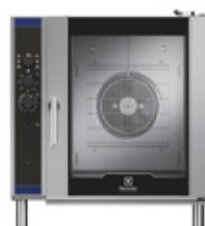
10 GN2/1 External dimensions (wxdxh) 890 x 1,225 x 950 mm Electrical power - 24.5 kW Gas power - 25 kW + 0.5 kW (electric)