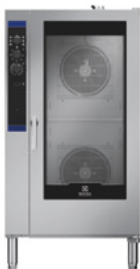
20 GN2/1 External dimensions (wxdxh) 890 x 1,230 x 1,750 mm Electrical power - 48.9 kW Gas Power - 50 kW + 1 kW (electric)