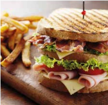
PUBS & BARS

Unlimited options for any kind of food service business.