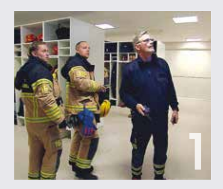
Alarm received - when the alarm sounds, all equipment is ready clean and safe - for action!