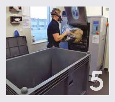
When you come back to the station the first action you need to do is to bring the laundry bags into the "dirty area" in the laundry and fill the barrier washer . Start the approved program.