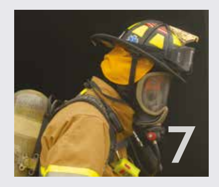
But it's not only about the uniforms... PPE Washer washes and sanitizes protective personal equipments as masks, helmets, boots and hoses to protect firefighters from cancer