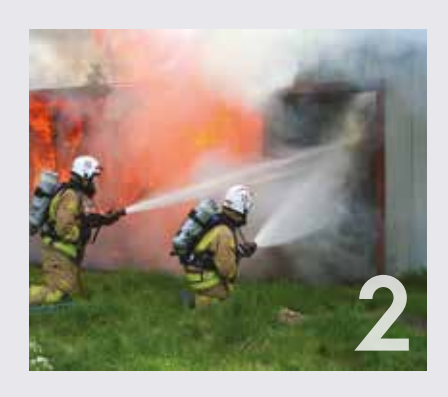
On site - High risk of contamination!