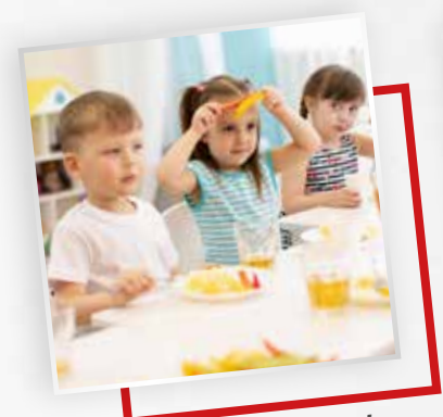
Kindergarden & schools

Grind your own flours for homemade cakes and pastries