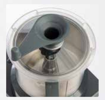
Full control thanks to the transparent lid