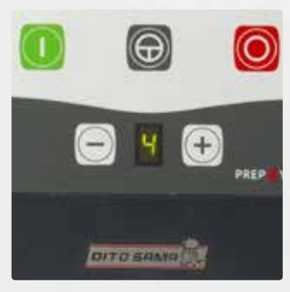
Intuitive control panel with easy to clean, flat and soft-touch buttons