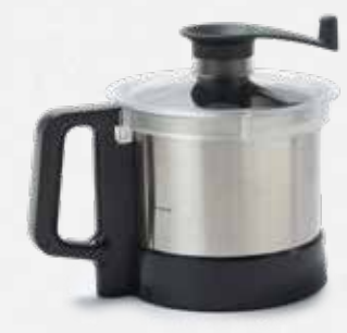
3.6 lt bowl AISI304 stainless steel