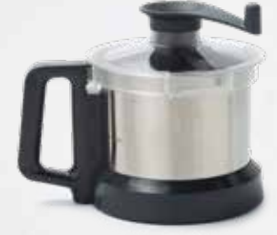
2.6 lt bowl AISI304 stainless steel