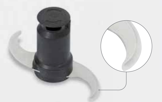
Smooth blade rotor available as optional, for clean cuts (for example meat tartare) and for delicate items like fresh herbs