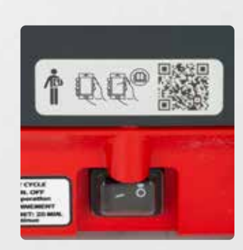
Scan the QR code on appliance backside to access user manuals, videos and other support materials

All parts in contact with food are BPA free for best food contact safety