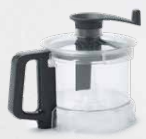
2.6 lt bowl Transparent copolyester