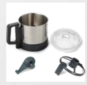
100% dishwasher safe for best hygiene. All parts in contact with food are easy to remove for fast cleaning