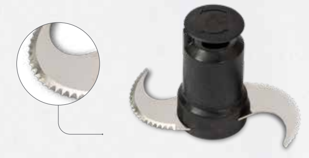
Micro-toothed blade rotor (included as standard) for chopping, grinding, mixing and emulsifying