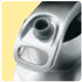
Stainless steel manual hopper (optional)

With its automatic hopper, the TR210 cuts large quantities of fruit and vegetables. Optional hoppers provide the flexibility to tailor the machine to meet different requirements.