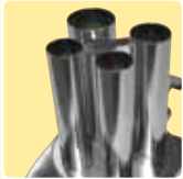
Stainless steel long vegetable hopper (optional)