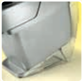
Incluy System 20° angled base (for use with above hoppers)