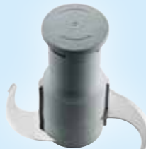
Smooth emulsifier blade