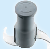
Smooth microtoothed emulsifier blade