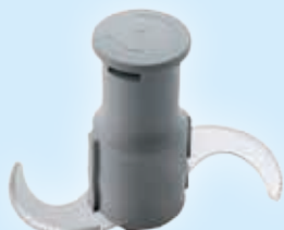
Microtoothed rotor blade