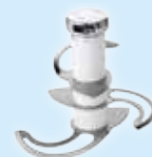
Smooth microtoothed emulsifier blade K180