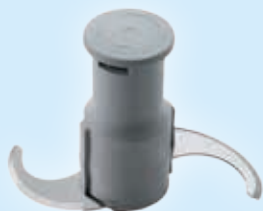
Smooth rotor blade