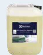
L00 - Laundry Eco Degreaser