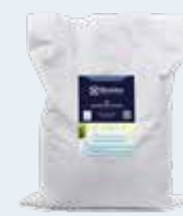
L01 - Laundry Eco Powder