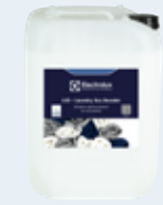
L03 - Laundry Eco Booster