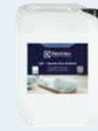
L05 - Laundry Eco Softener