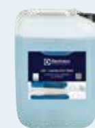
L02 - Laundry Eco Wash