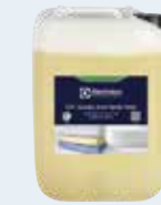
L07 - Laundry Swan Gentle Wash