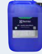
L08 - Laundry Swan Bleach