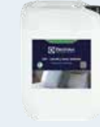
L09 - Laundry Swan Softener