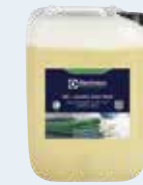
L06 - Laundry Swan Wash