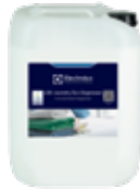
L00 - Laundry Eco Degreaser