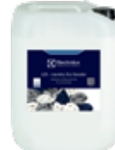
L03 - Laundry Eco Booster