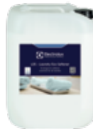
L05 - Laundry Eco Softener