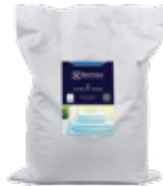
L01 - Laundry Eco Powder