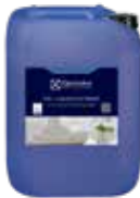
L04 - Laundry Eco Bleach