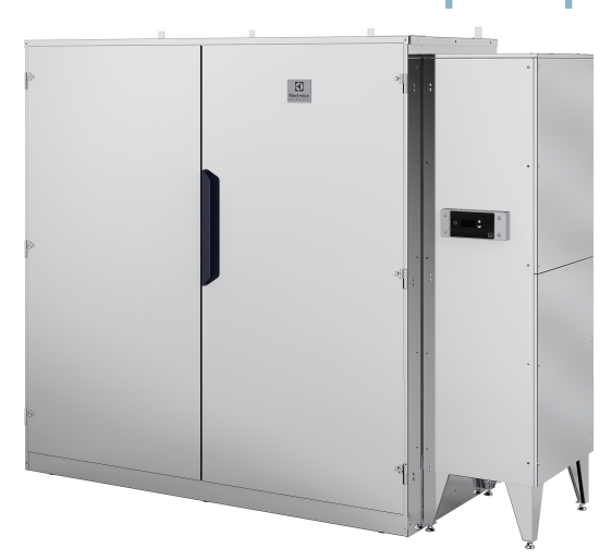
Images shown are a representation of the product only and variations may occur.

Option to activate child safety start lock