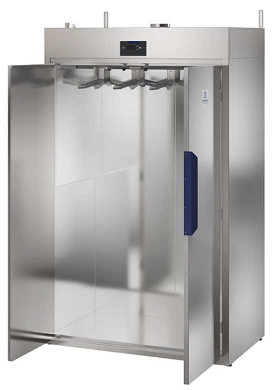
Images shown are a representation of the product only and variations may