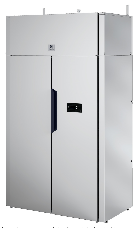
Images shown are a representation of the product only and variations may occur.