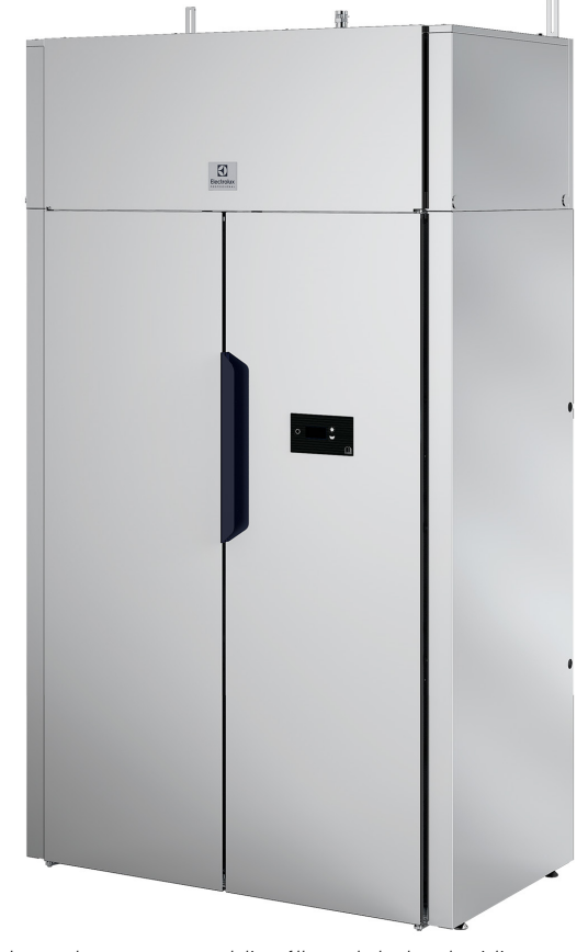
Images shown are a representation of the product only and variations may occur.

Option to activate child safety start lock