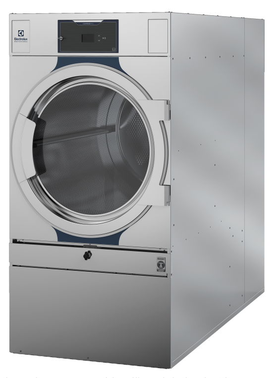
Images shown are a representation of the product only and variations may