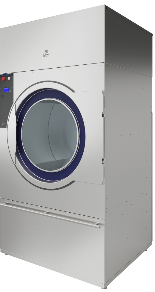
Images shown are a representation of the product only and variations may