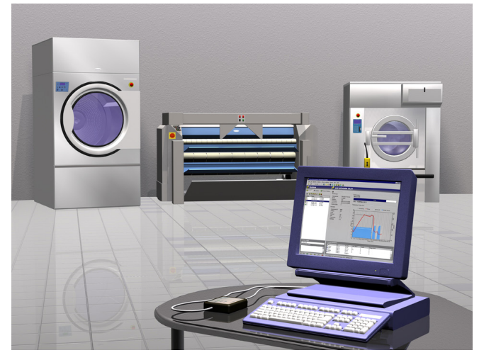
CMIS can be fitted to washer extractors with Clarus Control, tumble dryers with Selecta Control and ironers with electronic control system. All you need to access and view the statistical feedback is a normal PC.

• WPM PC program. Allows the creation of wash programs on a PC and their transference to the machine via a memory card.