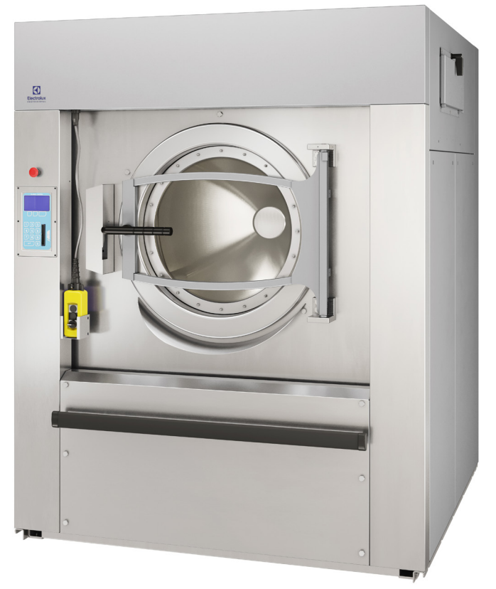
Images shown are a representation of the product only and variations may occur.