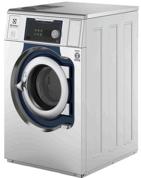
Images shown are a representation of the product only and variations may occur.

II. Log 6 reduction equals to 99,9999% viral infectivity reduction. The efficacy of reduction of SARS-CoV-2 and other pathogens in the process is confirmed by RISE (The Research Institute of Sweden) on the basis of Electrolux Professional laboratory data.