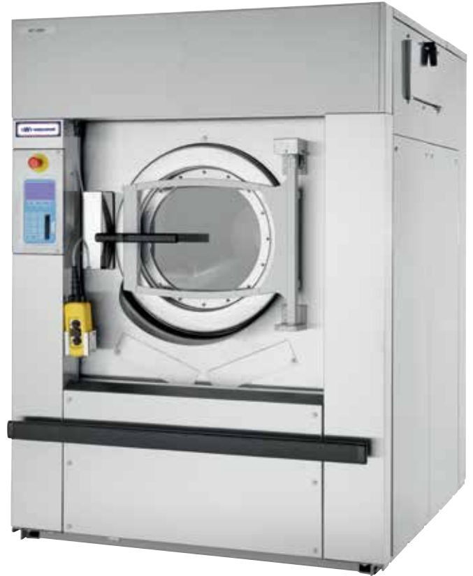
Images shown are a representation of the product only and variations may occur.