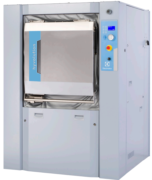
Images shown are a representation of the product only and variations may occur.