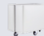
0W1Y2B Spring Trolley 229 lt