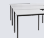
Working Table 0W1Y2H 1000 x 700 x 850 0W1Y2J 1500 x 700 x 850 0W1Y2K 2000 x 700 x 850