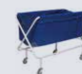
0W1XFY Canvas Trolley RV-74 - 200 lt