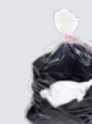
Water soluble bags (25 bags) 0W1XXU (S) 660 x 840 mm 0W1XXV (M) 710 x 990 mm 0W1XXW (L) 910 x 990 mm