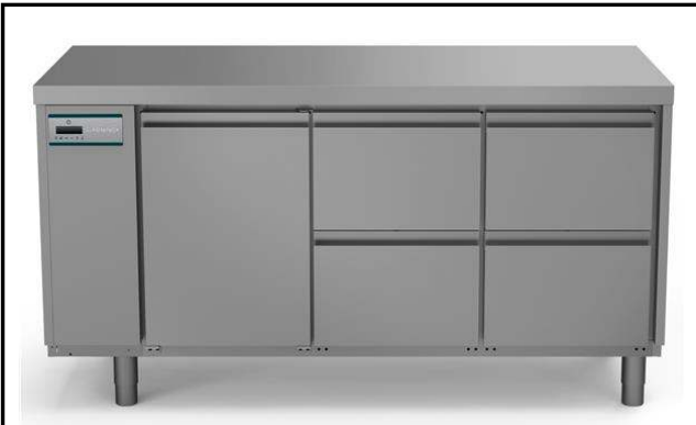
712046 (AH3RRABB) 1-door and 4-drawer refrigerated counter 440L, -2+10°C, AISI 304, remote