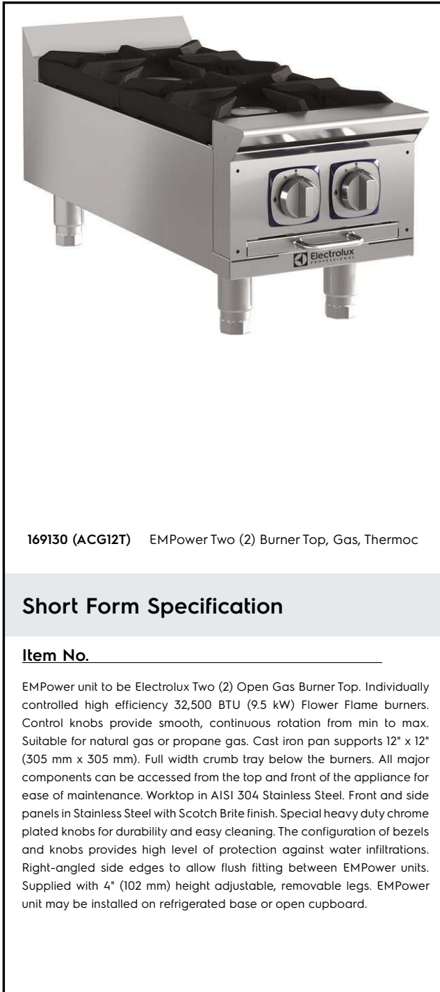
169130 (ACG12T) EMPower Two (2) Burner Top, Gas, Thermoc