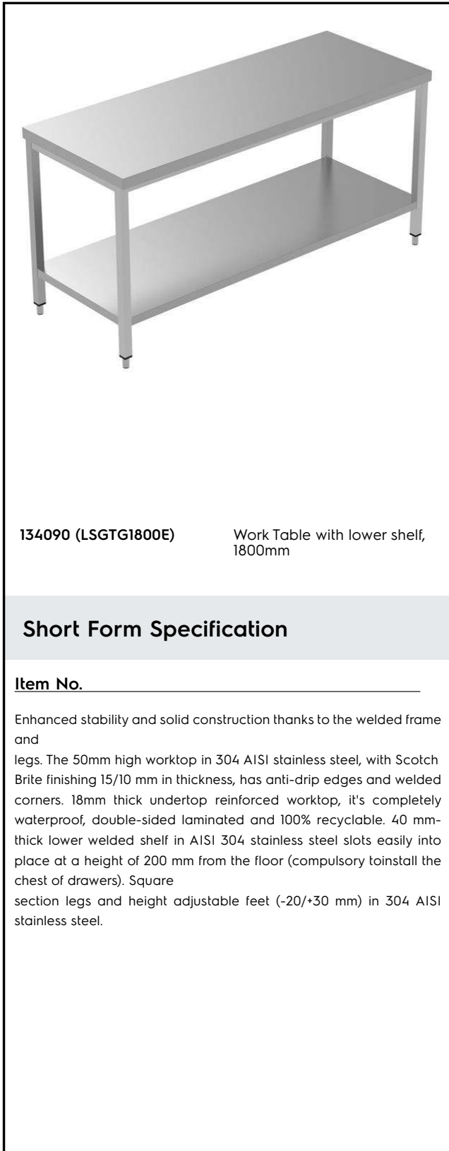
134090 (LSGTG1800E) Work Table with lower shelf, 1800mm