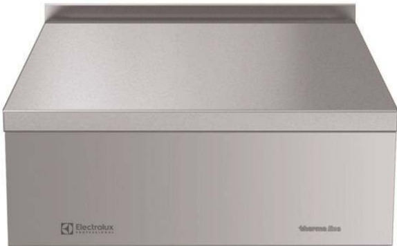
589163 (MCNABBG000) Closed Work Top, one-side operated with backsplash