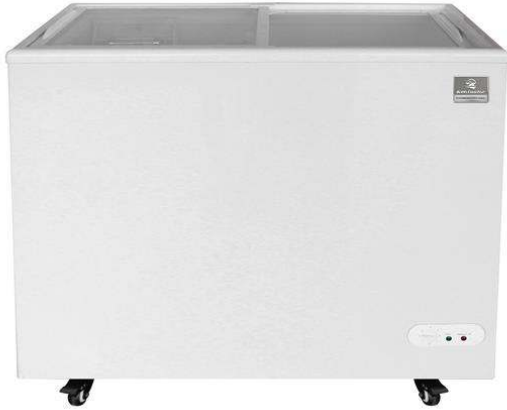
738090 (KCNF073WS) Sliding Glass Lid Novelty Freezer 38" Long