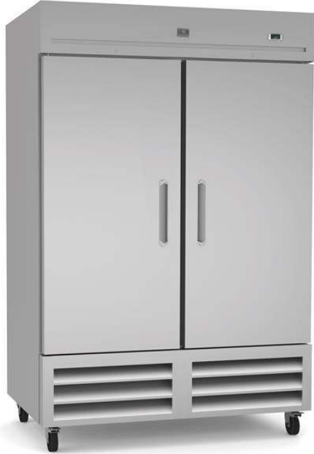
738245 (KCHRI54R2DFE) 2-Door Full Height Freezer 54 " Long