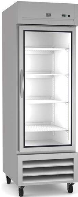
738278 (KCHRI27R1GDR) 1-Glass Door Full Height Refrigerator 27" Long