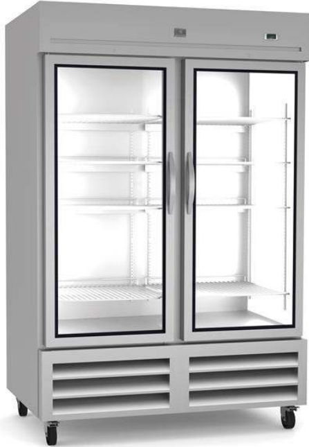
738281 (KCHRI54R2GDR) 2-Glass Door Full Height Refrigerator 54" Long