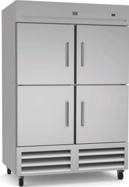
738282 (KCHRI54R4HDR) 4-half door reach-in refrigerator, stainless steel, 49 cubic feet, R290 refrigerant gas, +33/+41°F - Energy star