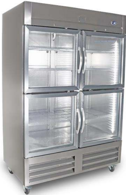
738316 (KCHRI54R4HGDR) 4-Half Glass Door Full Height Refrigerator 54" Long