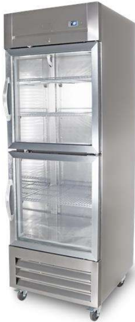
738317 (KCHRI27R2HGDR) 2-Half Glass Door Full Height Refrigerator 27" Long